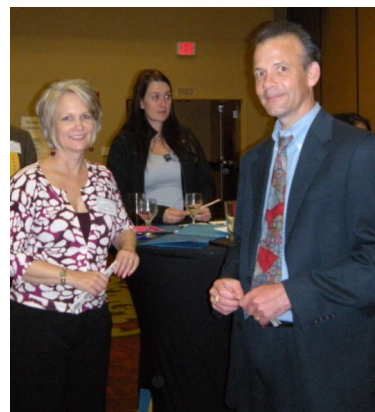
Enjoying the IHA Conference Reception