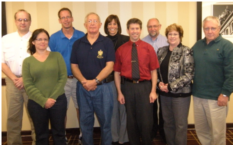
IHA Board of Directors