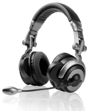
Arctic P531 USB Pro-Gaming

Visit our website for a complete list of our products. Ask us about our free search assistance.