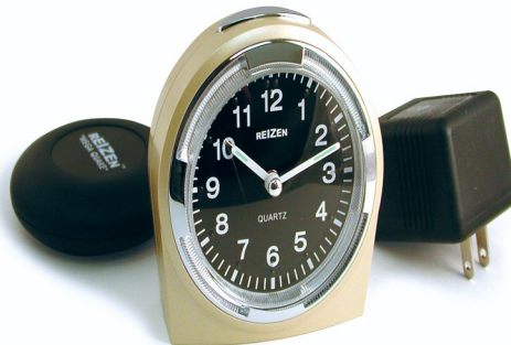
Reizen Braille Quartz Vibrating Alarm